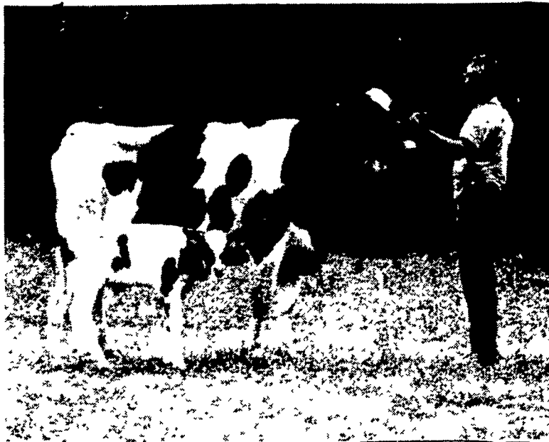
The grand champion cow at the recent West End Fair was, Irons Georgia-Lee owned by Zi-We Dairy Farm, Mifflinburg. She is shown here with her bull calf the evening following the show.