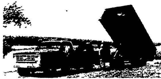
Grain Trailer Comes 8'x16' & Has 40" Grain Sides

Call 717-768-3832 between 7 a.m. & 9 a.m. or call 717-354-0723 after 6 p.m. East of New Holland, Pa.