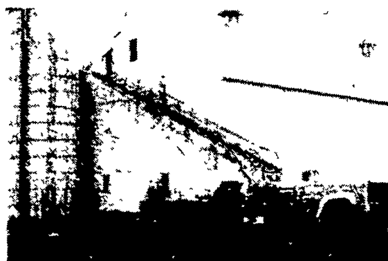
HYDRAULIC AERIAL EQUIPMENT