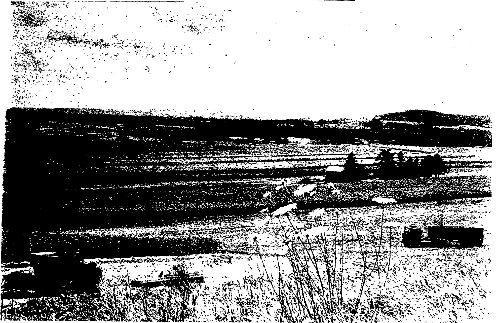
Leesport, Berks County