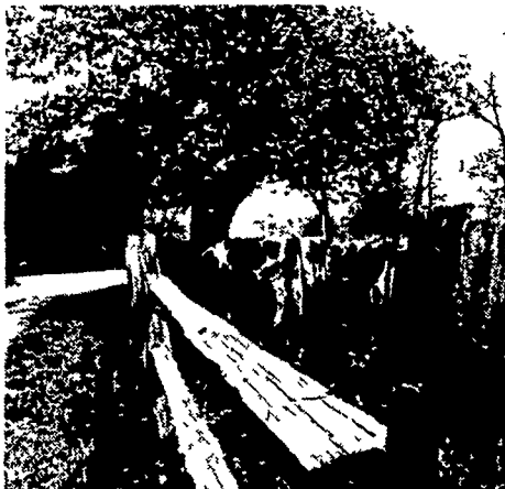
No. 1 in Dairy Nutrition