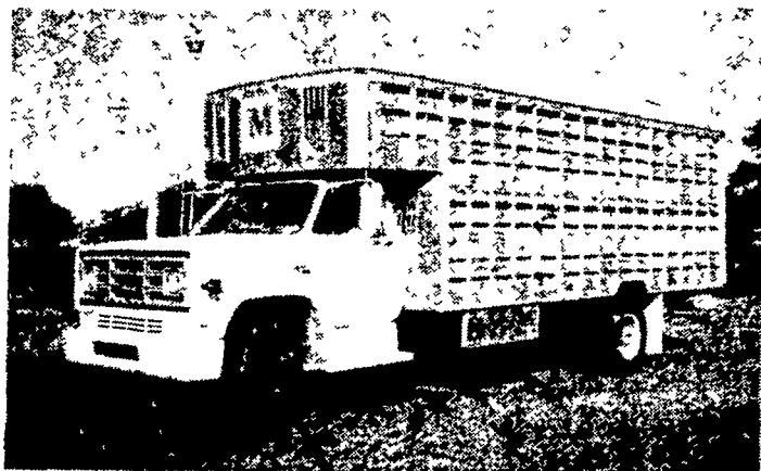
Aluminum Livestock Body

M.H. EBY, INC. Manufacturer of All Aluminum Truck Bodies Livestock, Grain & Bulk Feed