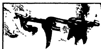
Patz double-hook gathering chain features knife-sharp cutters and claws.

Chain-saw action easily cuts silage loose. The Patz gathering chain loosens hard-packed or frozen corn silage, haylage or high-moisture corn and quickly gathers it into the powerful blower. The Patz high-speed power cutter with 4 self-sharpening, hardened-steel blades hugs the silo wall to eliminate silage buildup.