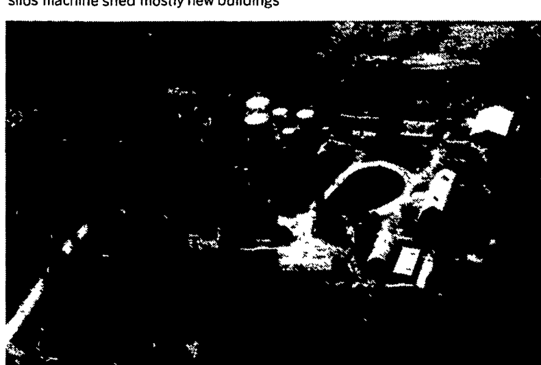
237 acre stock farm Modern two story home two large barns pole shed and hog house Brand new grain handling set up

All of these farms can be bought on contract with minimum down payments We have additional listings available