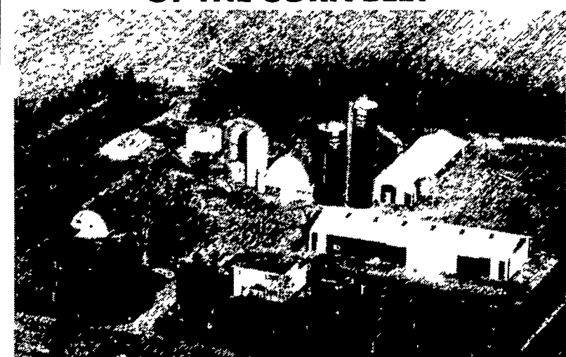
Ultra modern hog set-up with modern home-36x116 hog barn with pit 34x80 finishing buildings two Harvestores steel machine shed grain storage. Every