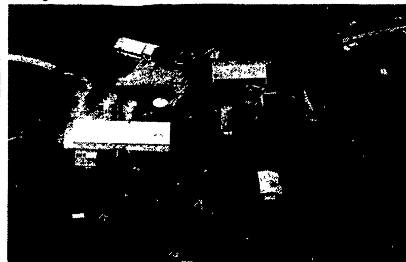
302 acre Dairy farm nearly new home 50 cow barn Harvestore and two stave silos machine shed mostly new buildings