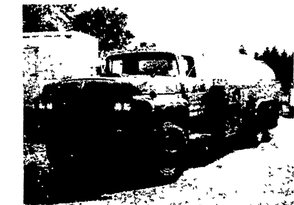
1958 F 800 Ford twin screw - 5 & 2 speed/air brakes with 2200 gal. stainless steel tank, good for farm use and liquid feed - very good condition.

Wagon Trailer - New four wheel Fruehauf; full trailer with steering, front bogie and tow bar, deck 28'x8' Capacity 20T Tires front 10 00x22, rear 11 00x22 Call Ed Eustile, 201-752-3600 Hoffman Equipment, Box 669, Piscataway, NJ