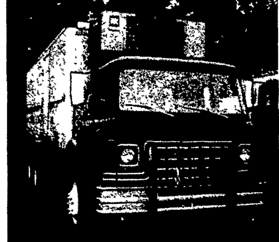
1975 Int. twin screw with 22 ft. Ref. body - more than 60 Ref. Trucks of all sizes to choose from.

MARTINS TRUCKSVILLE 560 Lampeter Rd., Lancaster, PA 17602 Phone 717-392-6266 BOB MARTIN