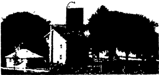
Eugene Martin Farm

Here's where you can go to see answers to your problems —