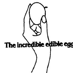
The incredible edible egg

Now Is The Time To Power That Chopper With A Case Diesel!