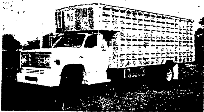
Aluminum Livestock Body

Distributor of TIMPTE Refrigerated Trailers Sales & Service Blue Ball, Pa. 717-354-4971