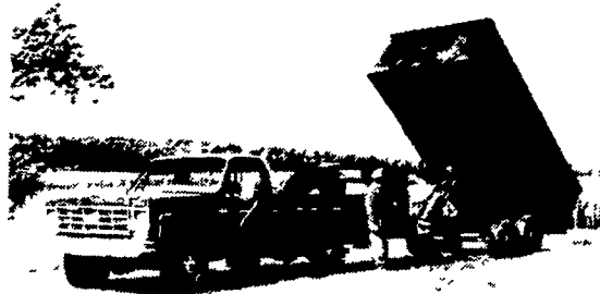
Grain Trailer Comes 8'x16' & Has 40" Grain Sides

Call 717-768-3832 between 7 a.m. & 9 a.m. or call 717-354-0723 after 6 p.m. East of New Holland, Pa.