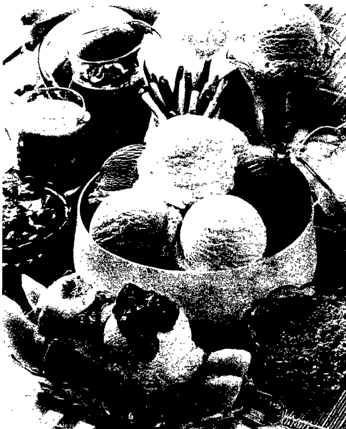
Cool, delicious ice cream