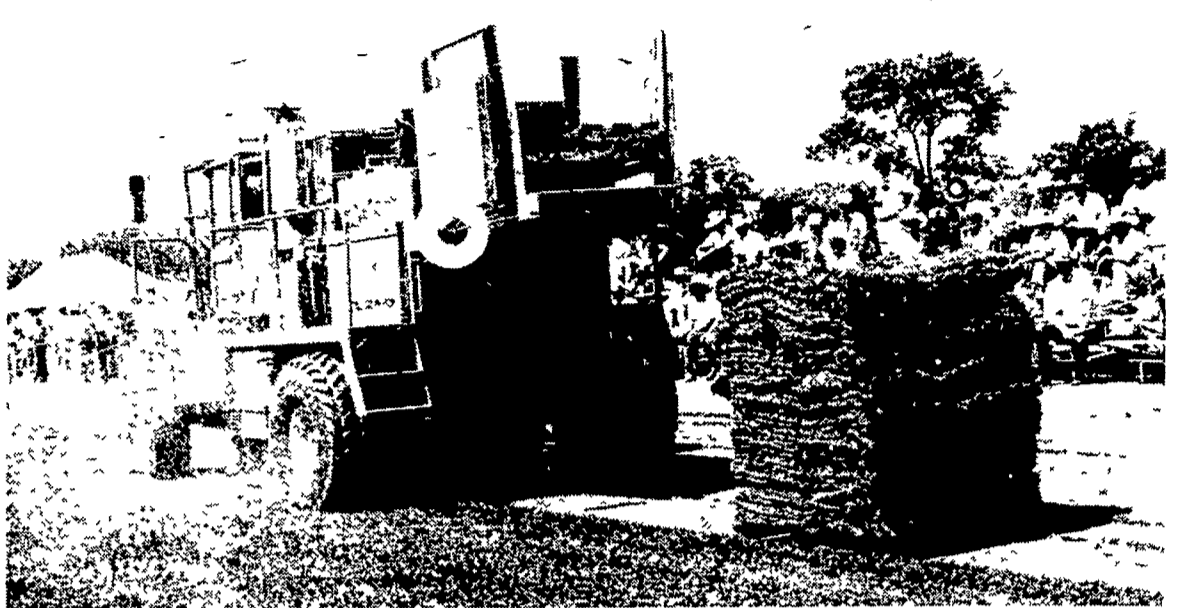
Councill's Turf Farm of Goldsboro, Md., demonstrates a one-man self-stacking sod harvester during the American Sod Producers' Summer Field Days at Sporting Valley Turf Farm, Waters Edge Road, Lititz.

Today, Sporting Valley has 225 acres in cultivation on three farms, employs 17 people and supplies central and eastern Pennsylvania, northern Maryland and Delaware markets with Pennsylvania certified sod for varied uses in residential, commercial, industrial, institutional and recreational areas.