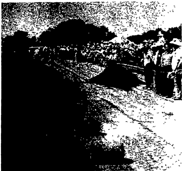
A Ryan sod-cutter from Lincoln, Nebraska, leaves a trail of sod-rolls ready to be picked up. Ryan built the original sod-cutter in 1948 and was the "first and only" until the late 1960's, according to Clarke Staples, Ryan representative.