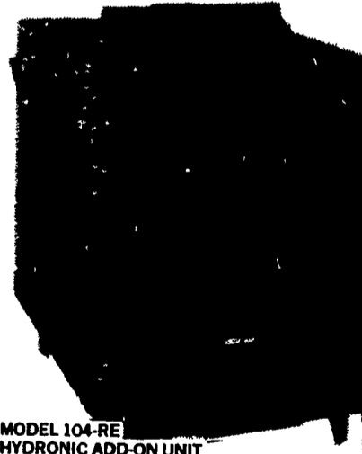
MODEL 104-RE HYDRONIC ADD-ON UNIT

TESTED TO UL 1102 STANDARD FOR RADIANT HEAT BY AN INDEPENDENT LABORATORY