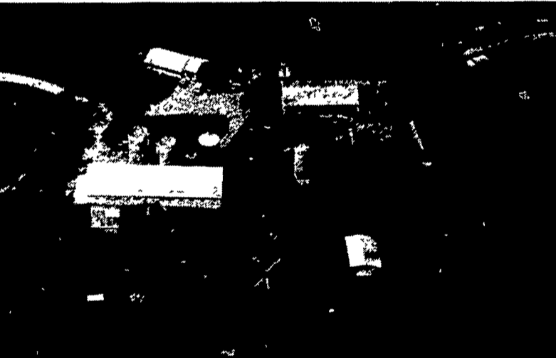
302 acre Dairy farm nearly new home 50 cow barn Harvestore and two stave silos machine shed mostly new buildings