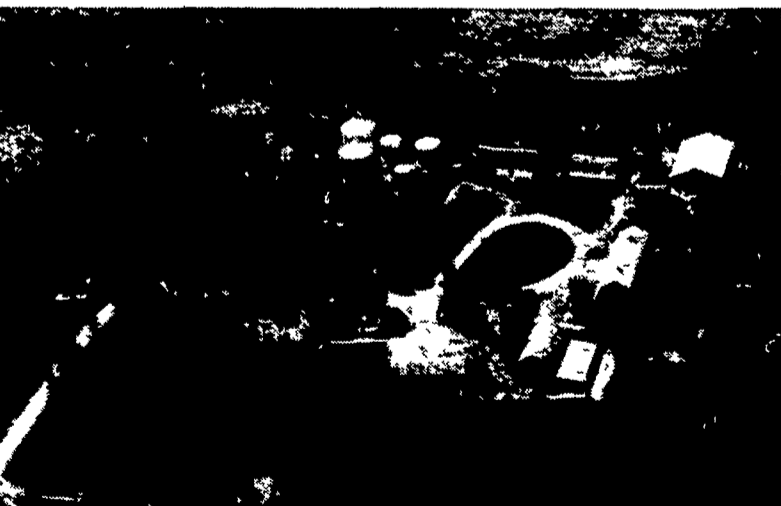
237 acre stock farm Modern two story home two large barns pole shed and hog house Brand new grain handling set up

All of these farms can be bought on contract with minimum down payments We have additional listings available