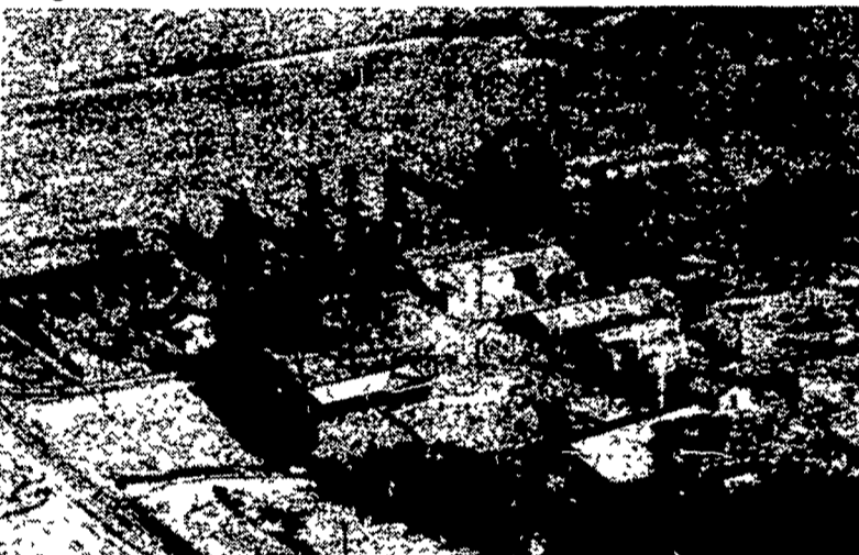
86 acre complete hog facility two homes one Rambler built in 1974-Two farrowing units grower unit finishing unit-two gestation buildings automatic feeding