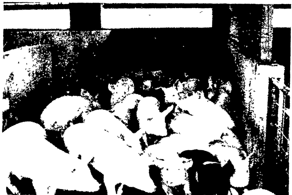
More Meat In Less Time! Most Hogs Go To Market In 5½ Months.