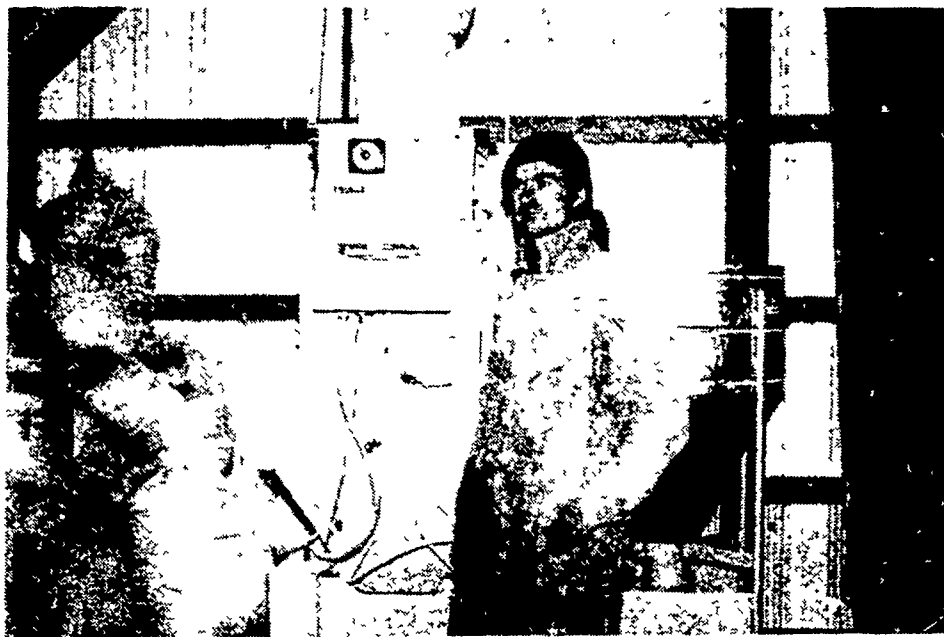
Gerald's Automated Feed Center.

"My hog operation is farrow to finish," explains Gerry. "The average hog goes to market in 5½ months. On my dry corn feeding program, the hogs averaged between 190-195 pounds going to market. Now with HARVESTORE High Moisture Corn, my hogs are averaging 210 pounds in the same amount of time."