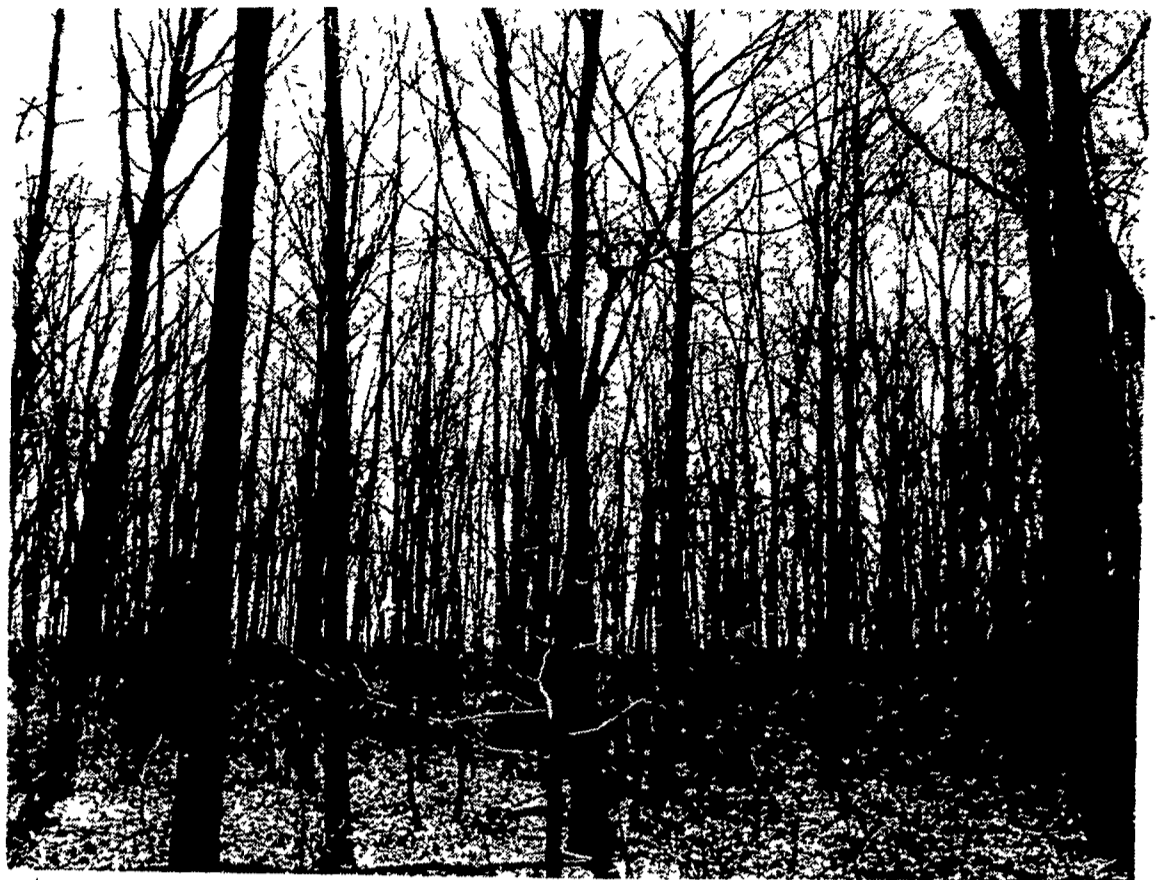
This section of Harford County, Maryland, depicts the defoliation caused by damaging gypsy moths.

can make fairly accurate projections of the spread of the insect and population levels in specific areas," Bystrak said. Control efforts to be undertaken next spring will in large measure be based on data collected as a result of the trapping efforts. Property owners are requested to cooperate with the trapping program by leaving the traps undisturbed until they are picked up. Questions concerning the trapping program can be directed to Bystrak at (301) 269-2957.