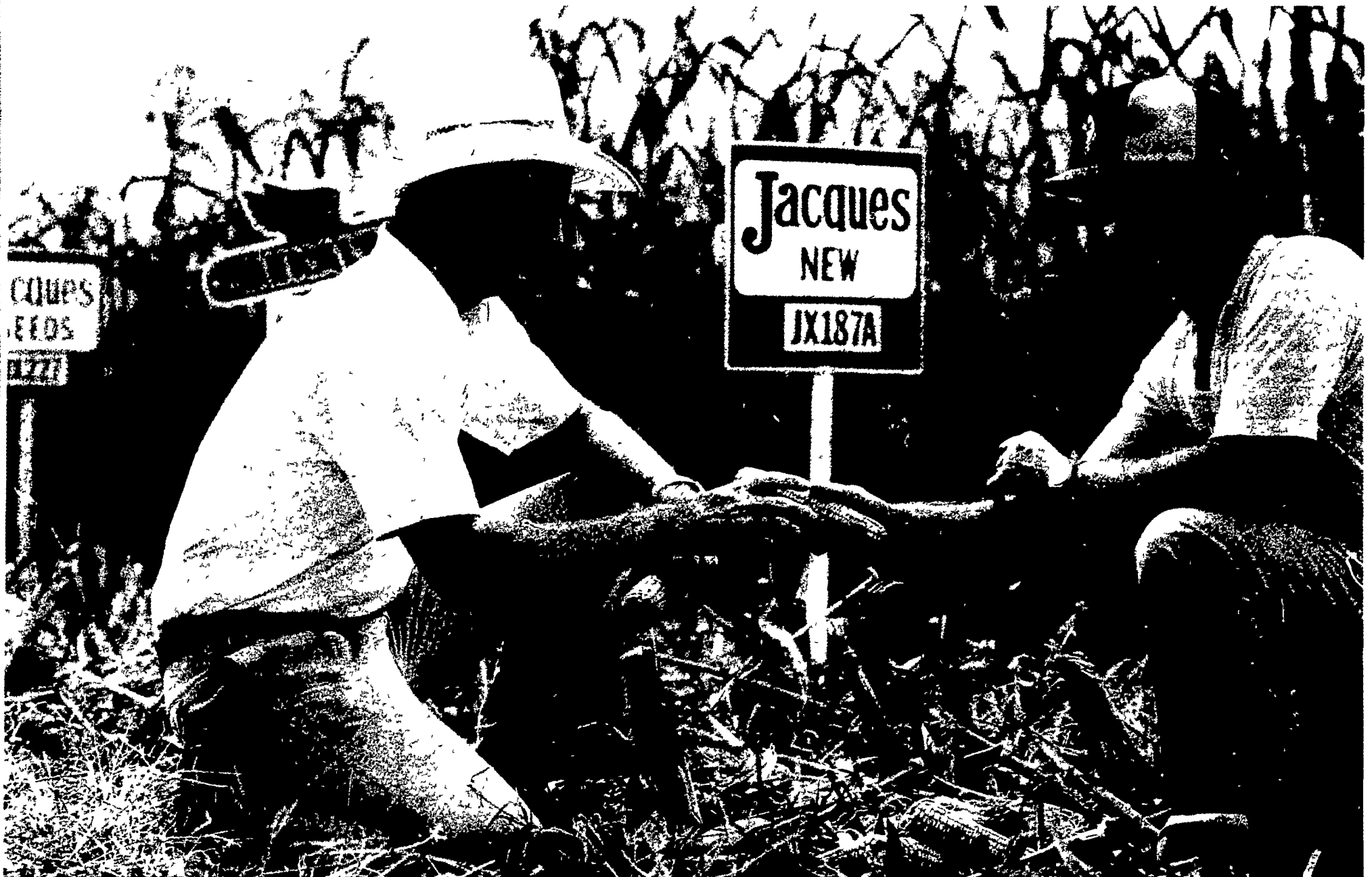
New hybrids are the lifeblood of your farming operations and good ears are the first indication of yield. But only harvest can tell you for sure how our new hybrids for '82 planting will measure up against tough competition.