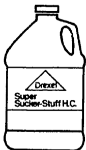
2 1/4 lb. K-MH