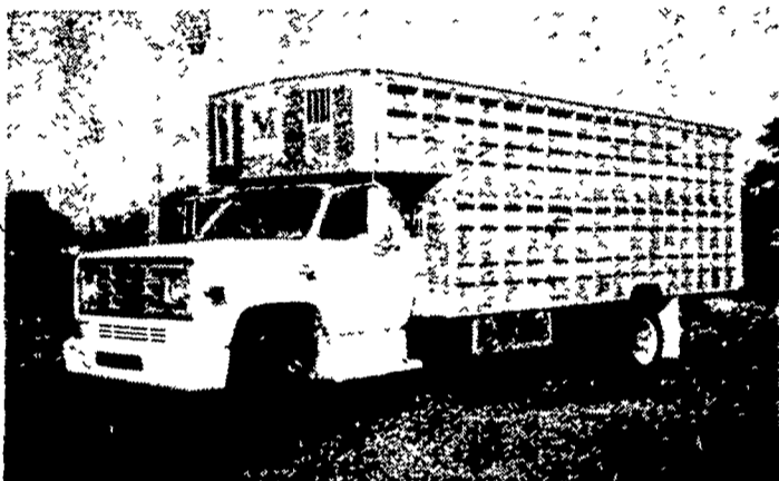
Aluminum Livestock Body

Distributor of TIMPT Refrigerated Trailers Sales & Service Blue Ball, Pa. 717-354-4971