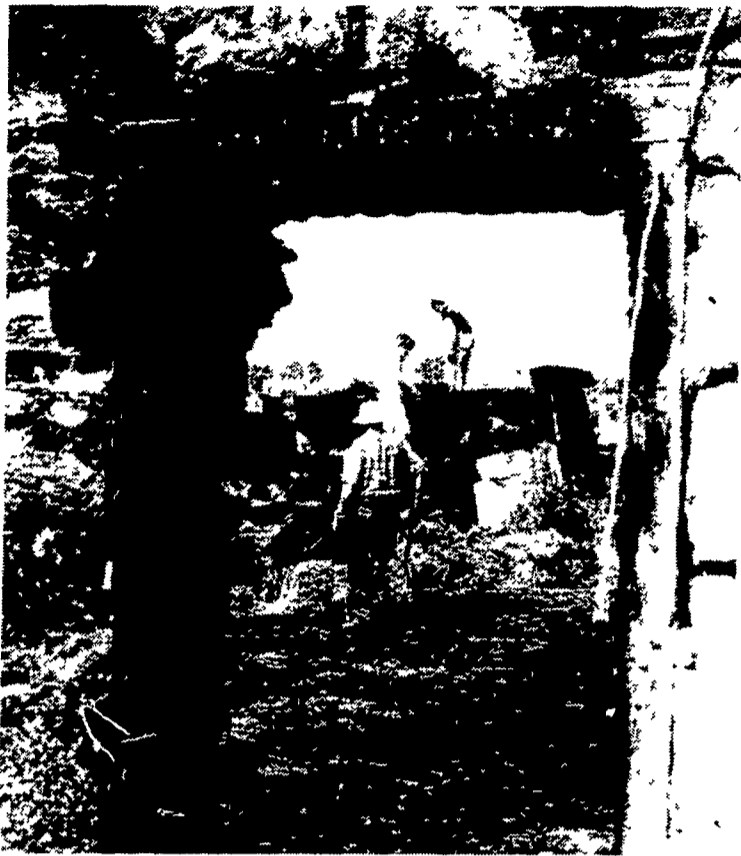
Charred window and foundation stone frame the activities of a few of the volunteers who aided in removing remains of barn destroyed by fire on the Sauder farm.