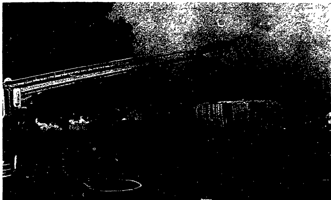
Firemen using aerial ladder continue to pour water on remains of large barn that was gutted by fire Wednesday morning on the Norman Sauder farm near East Petersburg in Lancaster County. The blaze was believed to have been caused by sparks from a tractor being used to haul straw.