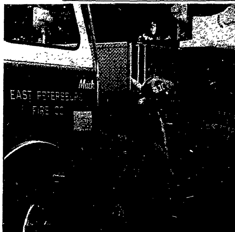
Young firemen takes a brief rest from duties at barn fire while others tend pumper used to bring water from East Petersburg.