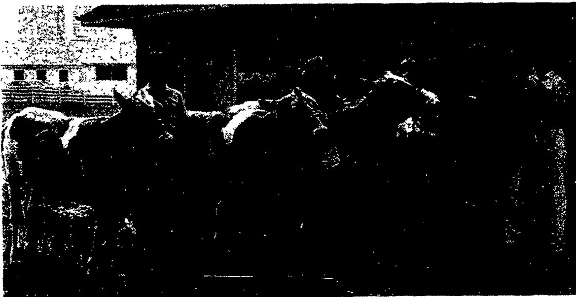
These bred triplet heifers and their dam, Leader's Dari Lassie, right, brought $875 each. This rare group of animals, born in 1979, were sired by Eber Lea Farms, Winston.