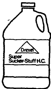
2 1/4 lb. K-MH