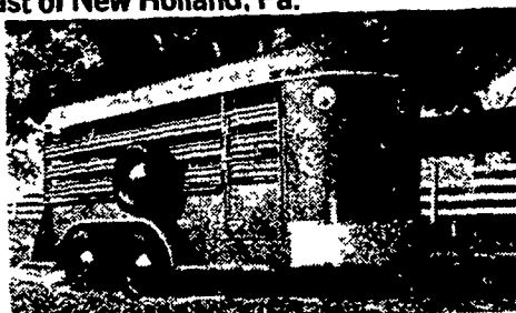
SPECIALS - 6x16 BUMPER TRAILER w/CANVAS - $2395 Small Trailers For Tractors