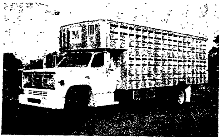
Aluminum Livestock Body

Distributor of TIMPTÉ Refrigerated Trailers Sales & Service Blue Ball, Pa. 717-354-4971