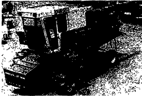
INTERNATIONAL 915 COMBINE 28Lx26 Drive Tires, 12.4x16 Rear, Necco Grain Saver, 1340 Hours, Monitor.