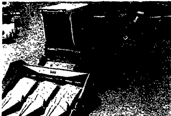
ALLIS CHALMERS GLEANER M Corn and Soybean Special, Hydrostatic Transmission, 18.4x30 Drive Tires, 11Lx16 Rear, Air Conditioned, Hillside Blower, 438 Corn Head and 13' Grain Saver.