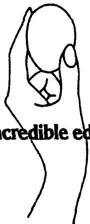
The incredible edible egg