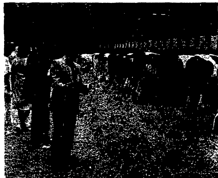
The President's reception also offers a chance to appraise potential purchase.