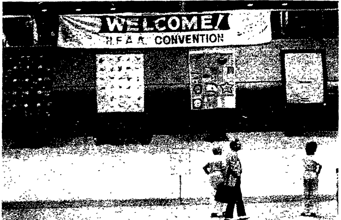
Making their way to the crab feast, convention goers are greeted by the HFAA banner in the spacious lobby of the convention center.

The food was great, the dancing and music—superb and the animals—they're the high producing Holsteins and without them Baltimore could have been just another spot on the map this week.