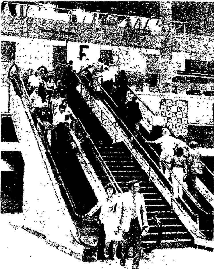
The HFAA convention provides guests with an opportunity to visit the new convention center, opened just two years ago.