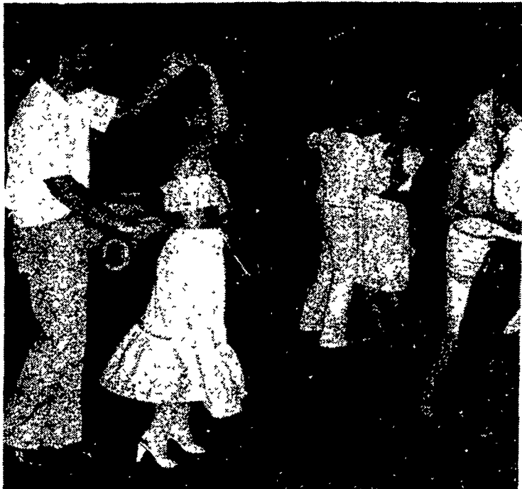
This couple leaves the cares of the farm behind, at least for a while, as they dance to tunes from the '50s and '60s.