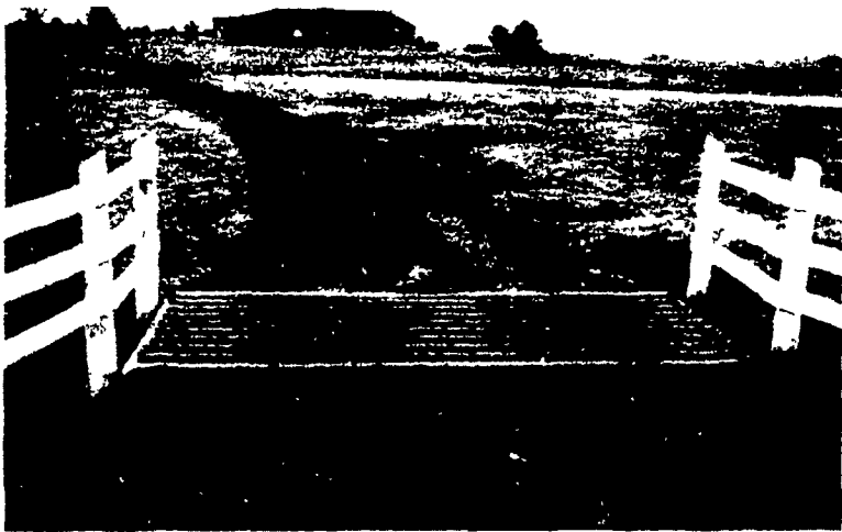
Saves a Lifetime of Gate Opening