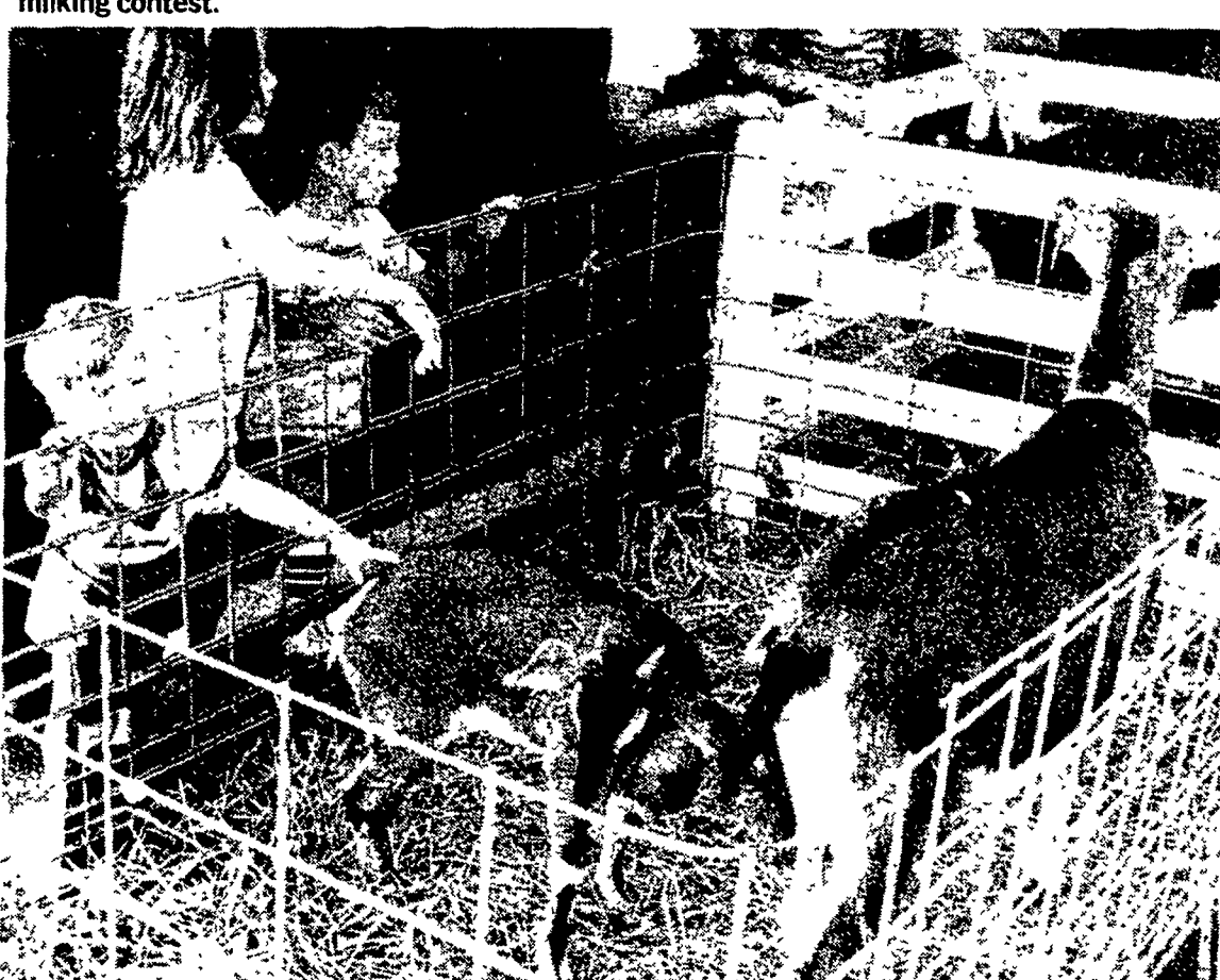
Where there are animals, especially furry ones, there inevitably will be tiny hands reaching to touch them. Such was the case at