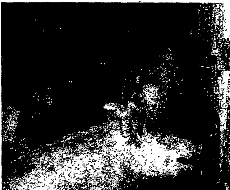
One of the registered Yorkshire Hogs enjoys a drink from one of the automatic waters in the finishing unit on the Miller farm, during the Seven Valleys Farm Tour.

Even though rain dampened the spirit of the day, city cousins who braved the weather to participate in the Seven Valleys Farm Tour left with a better understanding and appreciation for the life led by the farmers and their families.