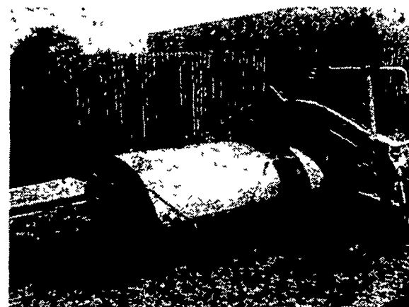
GEHL 72 6-Ft. FLAIL CHOPPER Used One-Half Season - Like New SALE $2,500 GEHL 72 6 Ft. FLAIL CHOPPER New, KD, FOB Shop SALE $3,995