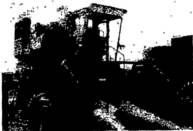
JOHN DEERE 55G SQUARE BACK With 334 Cornhead and 12' Platform, Field Ready... $8,500