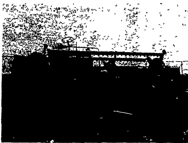
JOHN DEERE 800 WINDROWER 11 ft. With Conditioner, Engine Overhauled $3750