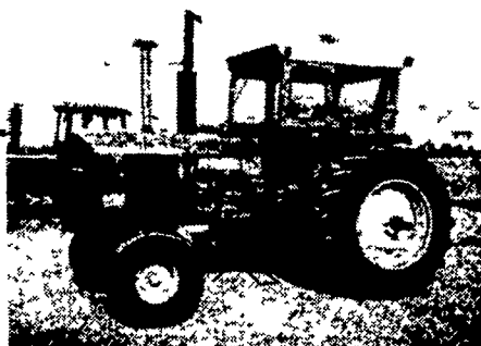
JD 4620 Power Shift, Air, Heat, Quick-Coupler ..... $18,300