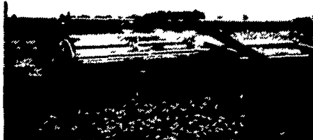
Hesston Hydro-Swing Mower Conditioner ... $4450

AUTHORIZED SPERRY-NEW HOLLAND PARTS and SERVICE