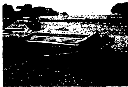
Hesston PT7 Mower Conditioner ..... $1950