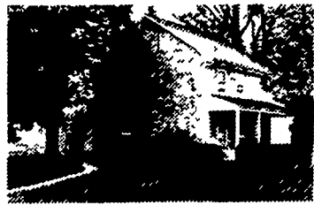
Stone house - Farm #1

212± Acres (170 tillable). In 3 parcels.