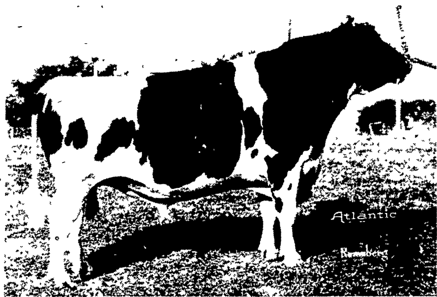
15H192 Marlu TITAN — EX

143 Daus. in 93 Herds Ave. 16,871M 3.6% 599F Predicted Difference (88% rpt.) +1,472M +$151 +32F 36 Daus. Cl. 78.5 (act.) 80.4 (age-adj.) +.43 PDT Type Strengths: fore udder, teats, legs & feet, and style. Sire: Round Oak Rag Apple Elevation — EX & GM Dam: VG with records to 30,770M and 1,054F