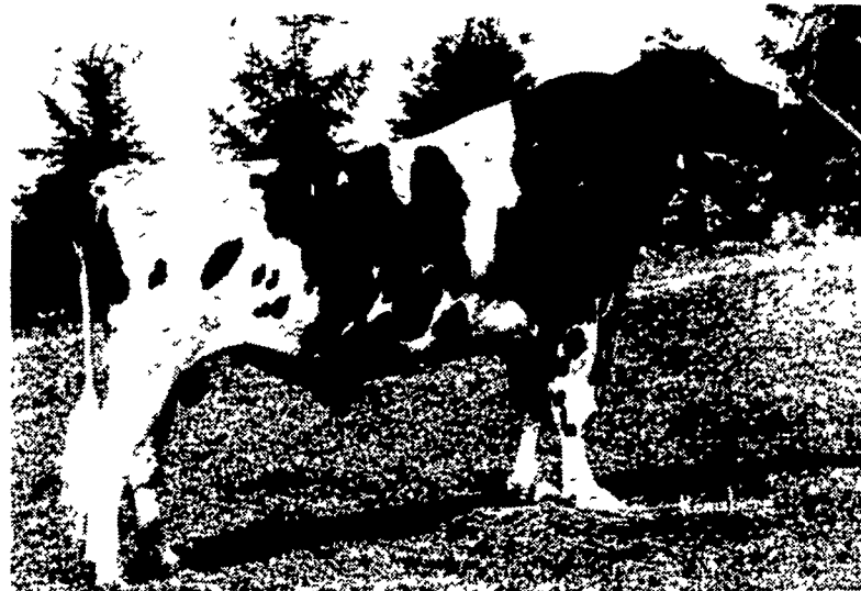
15H228 Fultonway TRANSFORMER — GP

All are priced reasonably through Professional Technician service and Direct-Herd sales!