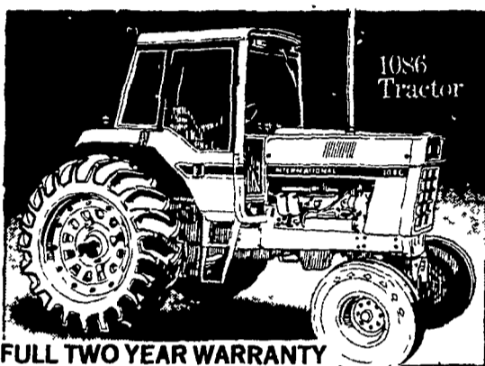
FULL TWO YEAR WARRANTY

Waiver of Finance on New Holland Hay Tools until Oct. 1, 1981 or Cash Rebates