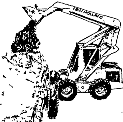
NH L445 Skid Loader

IN STOCK READY TO GO: ■ INTERNATIONAL MODEL 183 VIBRA-TINE 6 ROW CULTIVATOR ■ INTERNATIONAL MODEL 183 VIBRA-TINE 4 ROW CULTIVATOR