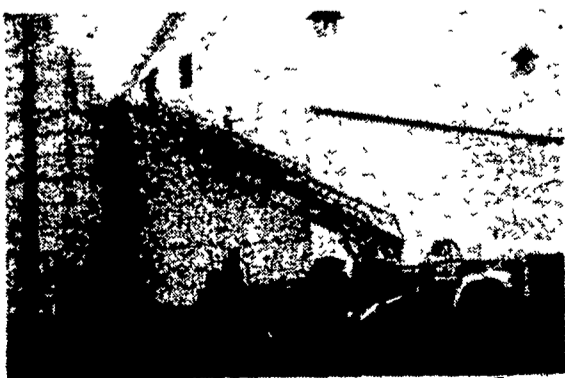
HYDRAULIC AERIAL EQUIPMENT

Seal Crete, Inc. RD2, Ephrata, PA 717-859-1127