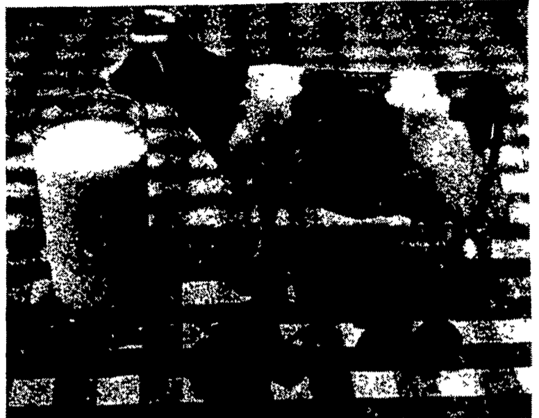
The REAL Seal is the mark of genuine dairy products, from cow to consumer.

the Mid-Atlantic agency, are funded largely by voluntary advertising checkoffs contributed by dairy producers in Federal Order 4, plus some participation of checkoff monies from Federal Order 2 and Order 36.