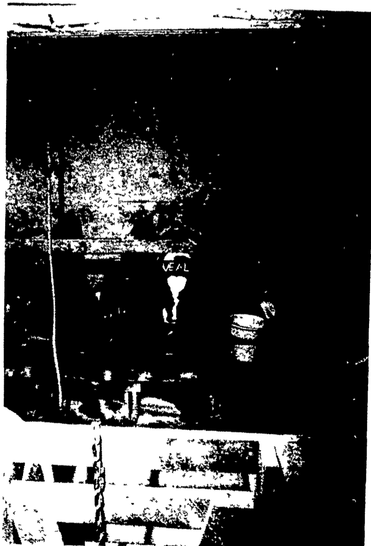
Unaware of the label above his head, this young Holstein calf appears happy and content. He must be looking forward to joining the other steers in the feedlot, rather than what his name implies.