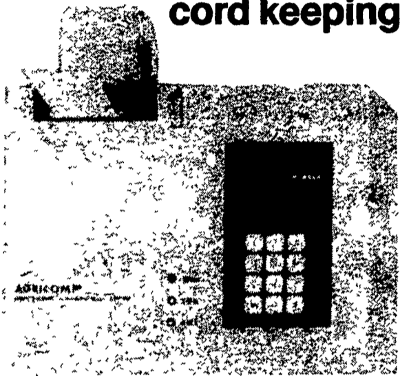
AGRI-COMP 2025 COMPUTER

A system designed and built to combine the most innovative dairy automation with computerized dairy record keeping.