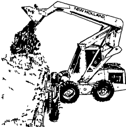
NH L445 Skid Loader