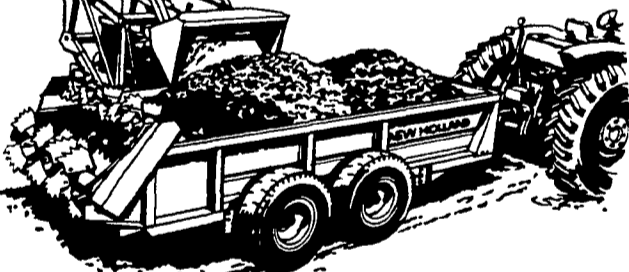
NH 791 10 Ton Spreader

Built Extra Rugged For Extra Dependability.