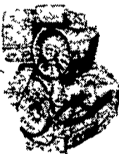
2 Cyl. F2L-912

We Have SR2 12 h.p. Lister Diesels, as is or rebuilt.