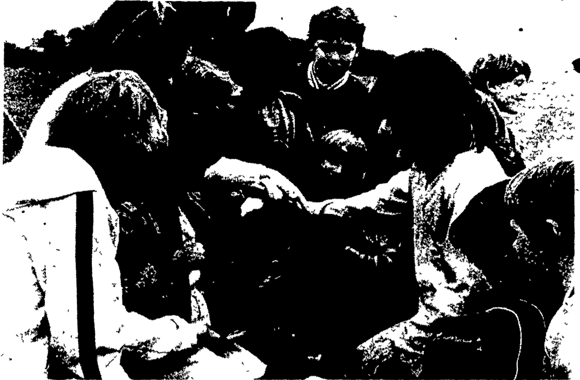
If you look closely amidst this sea of ardent admirers, you'll likely find a calf. Members of the Manor FFA chapter took a variety of

But after all, that's what the FFA project is all about.