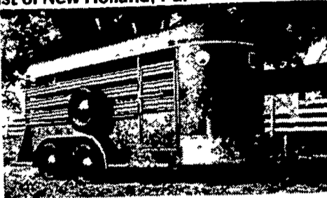
SPECIALS - 6x16 BUMPER TRAILER w/CANVAS — $2395 Small Trailers For Tractors

CARL MARTIN YOST FOR SUPERIOR COURT See Page A-18