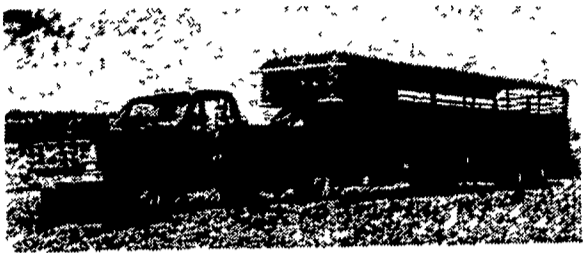
STANDARD LIVESTOCK TRAILERS WITH METAL TOPS IN FRONT COMES IN 14, 16, 20, 24' LENGTHS

Call 717-768-3832 between 7-a.m. & 9 a.m. or call 717-354-0723 after 6 p.m. East of New Holland, Pa.