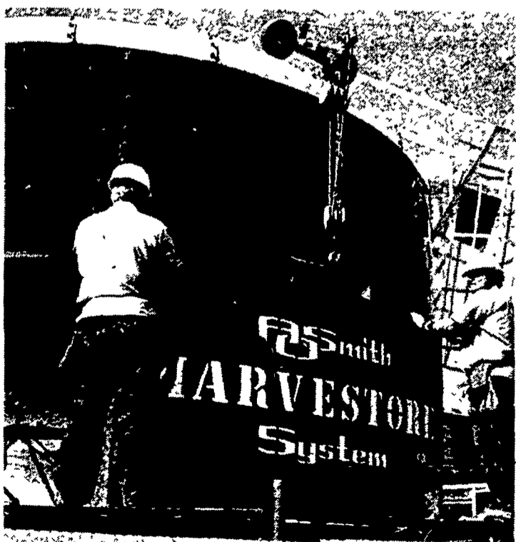
Building crew erects a structure "from the top down," jacking it up as each ring of sheets is bolted into place. Torque wrenches are used to set each bolt. (Safety Guards on building scaffold have been removed for photographic purposes.)

ADD IT ALL UP, AND YOU'LL SEE WHY WE SAY A HARVESTORE STRUCTURE IS MORE THAN JUST A SILO. IN FACT, THERE'S ABOUT AS MUCH SIMILARITY AS THERE IS BETWEEN YOUR BIG NEW DIESEL TRACTOR AND GRANDPA'S TEAM OF HORSES.