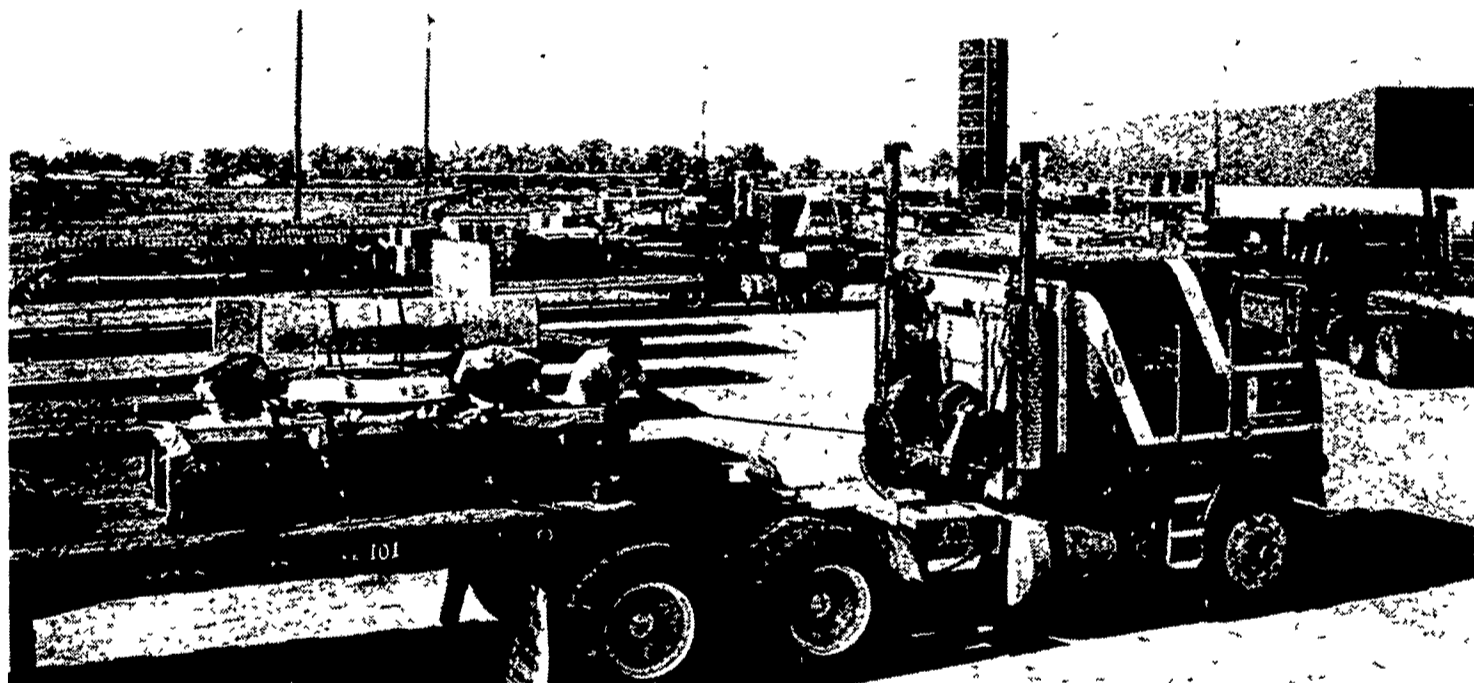
Loaded trucks each carrying a Harvestore structure or Slurrystore system, prepare to leave DeKalb for farms and ranches in all parts of North America.