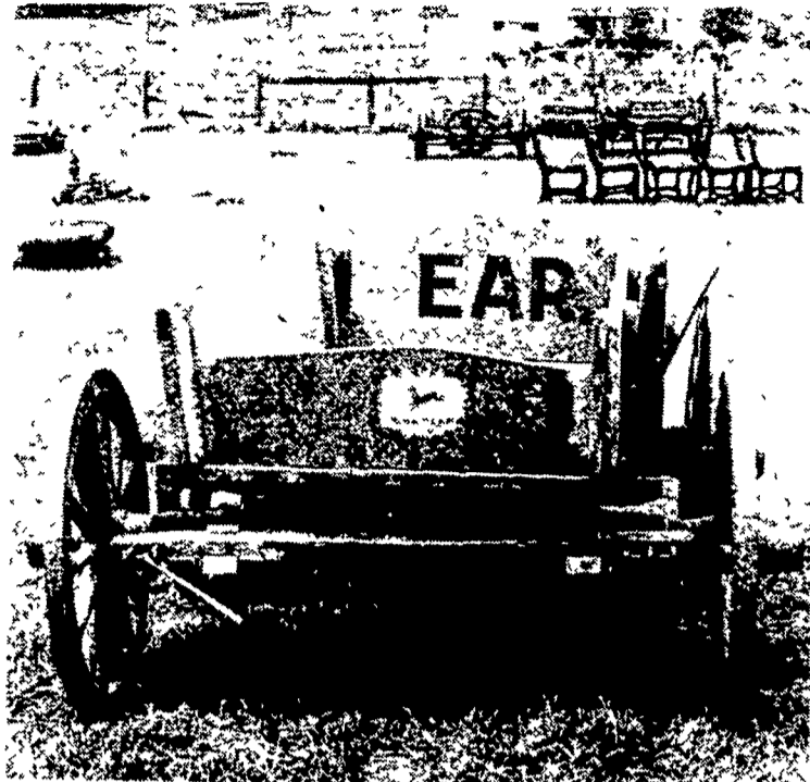
Whoever came up with these makeshift ends for small wagon at Martin's Auction was a bit of a poet. The front end shows the familiar Deere logo and the back end with the word "ear" is actually from an old wood Burma Shave sign.