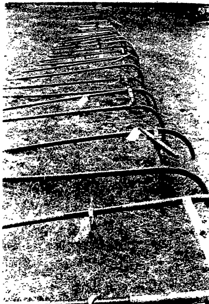
This field is sprouting all kinds of shafts. They come in all colors, configurations and conditions. Each will become a part of a restoration project that will put another horse-drawn vehicle back on the road.

any more of the old cars uncovered under a pile in the barn," Martin said.