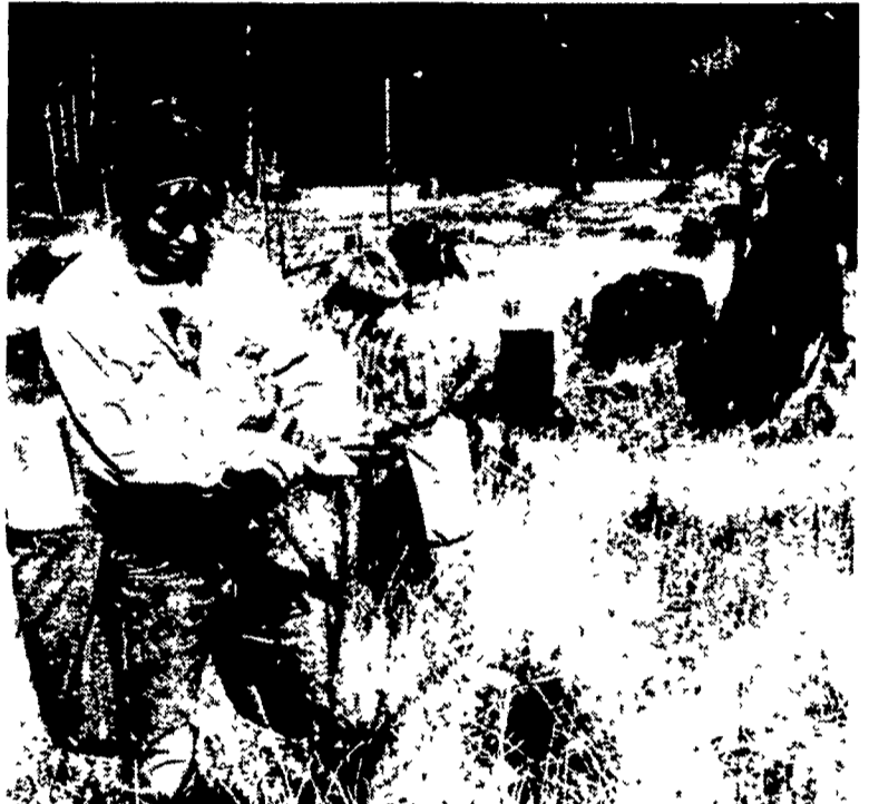
Tree seedling is planted by member of FFA chapter in Elma, Wash. as part of BOAC project that features reforesting of some 1,200 acres of timberland with a million seedlings.