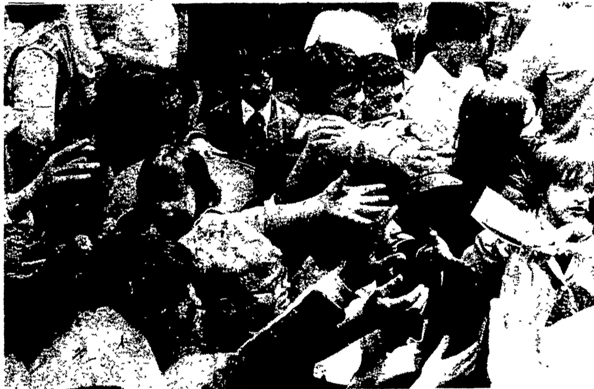
"Eggcited" was the word used to describe the children who gather around Eggatha for a signed picture at Lancaster's omelet festivities.