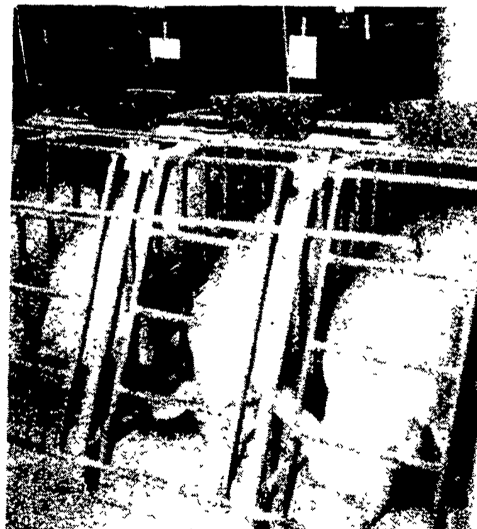
FARMER BOY GESTATION STALLS WITH SURPRISE FEEDING SYSTEM