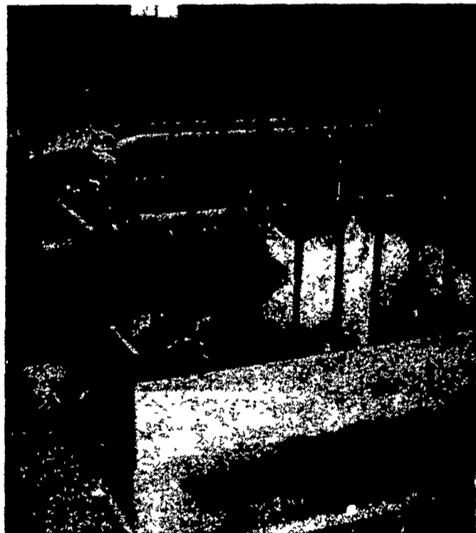
FARMER BOY FARROWING CRATES WITH TOTAL WOVEN WIRE FLOORING