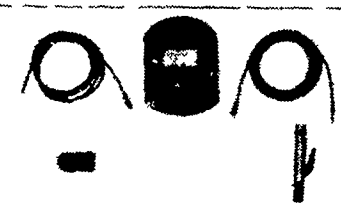
Accessories included with each heavy duty welder

WE MADE A SPECIAL PURCHASE - PASSING THE SAVINGS ONTO YOU!